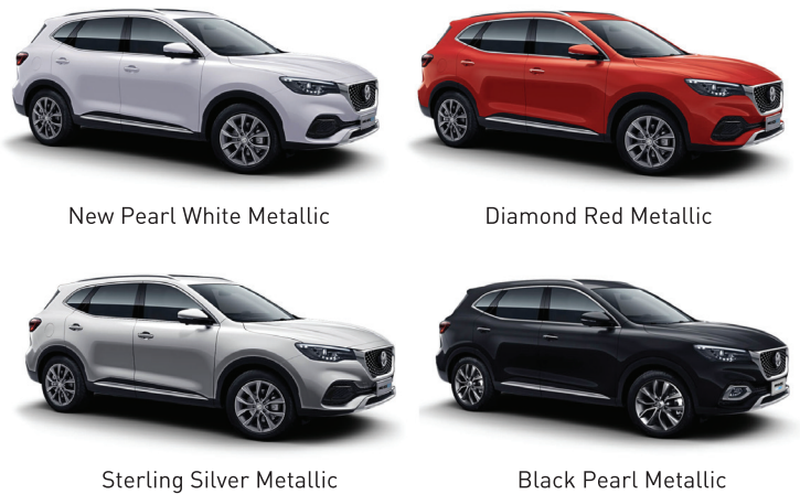
New Pearl White Metallic