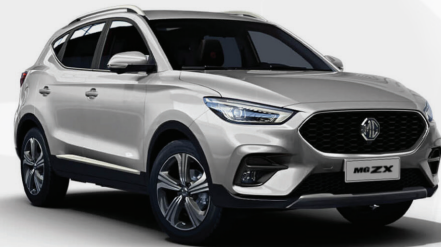
MG ZX Vibe