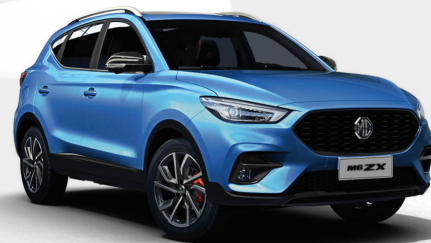
MG ZX Essence