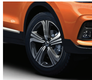
Vibe 17" Alloy