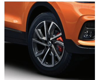
Essence 17" Alloy